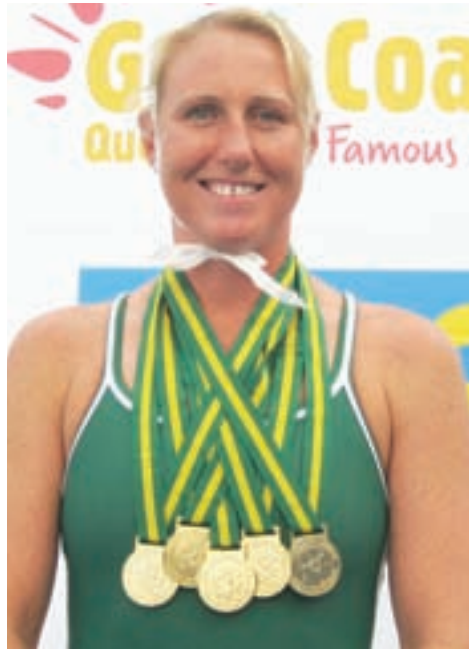
Naantali Marshall 35-39 Years Female Surf Race 35-39 Years Female Rescue Tube Race 35-39 Years Female Surf Board Race 35-39 Years Iron Woman Race