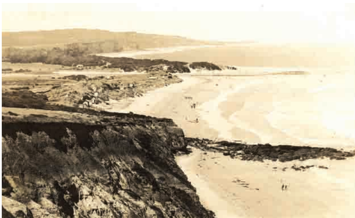
VALENTINE SERIES No. 1912 COASTAL VIEW OF ANGLESEA SHOWING POINT ADDIS IN DISTANCE