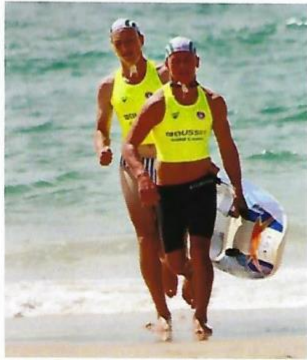
Nipper Scholarship Champions