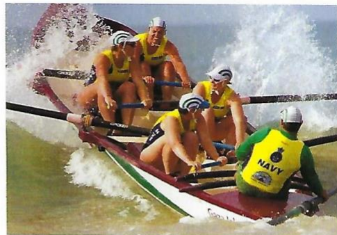
Boat in surf