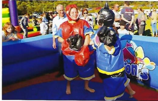
Family Fun Day - Sumo Wrestling