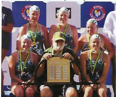
Senior Girls R & R Team. Australian Gold Medallists