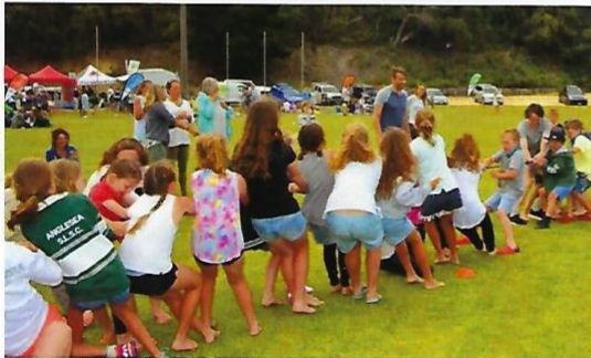
Family Fun Day - Tug of War