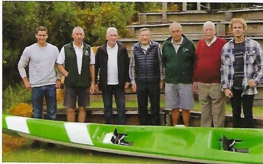
Supporters Group & Double Ski